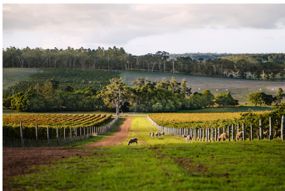
Margaret River vineyard