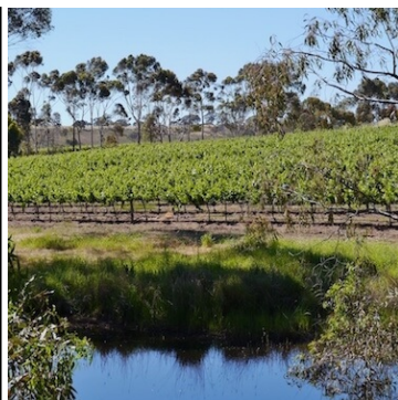
Clare Valley vineyard